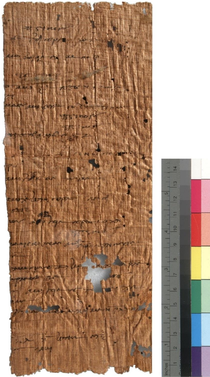
Egyptian Museum in Cairo, the Special Register Nr. 3049 with inv. 81 recto.